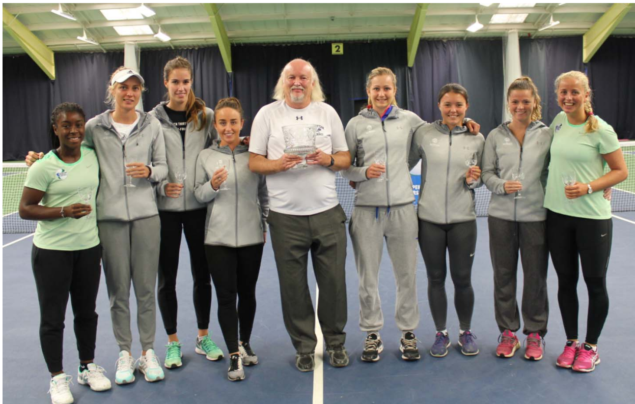
Wilton Tennis Club (Surrey) – National Open Women's Winners 2017

2017 – Wilton Tennis Club beat. Cumberland LTC