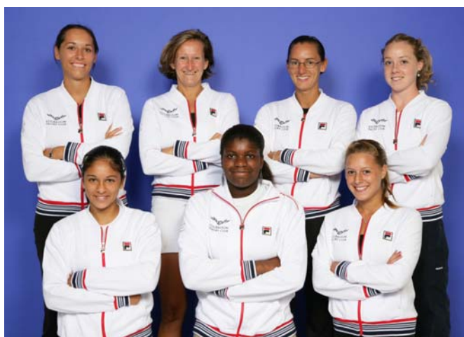
Edgbaston Priory Club (Runners-Up 2008)

2008 – Holcombe Brook Sports Club beat. The Edgbaston Priory Club