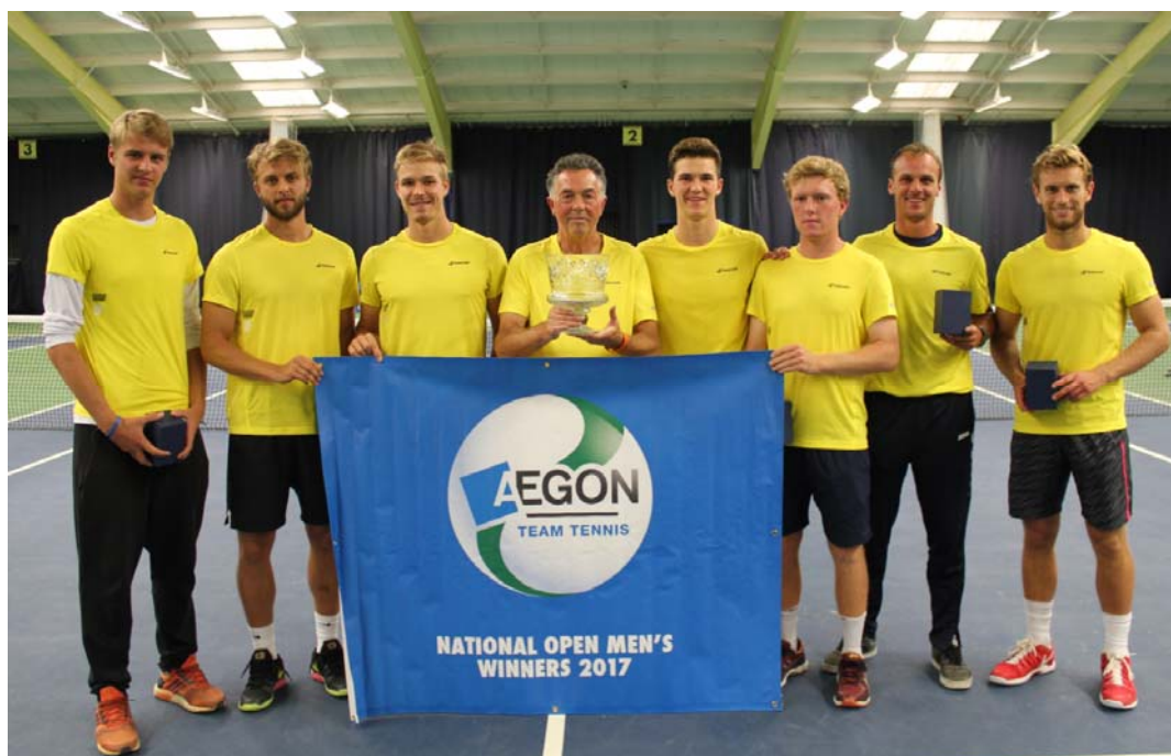
Sutton Tennis & Squash Club – National Open Men's Winners 2017

2017 – Sutton Tennis & Squash Club beat. David Lloyd Raynes Park