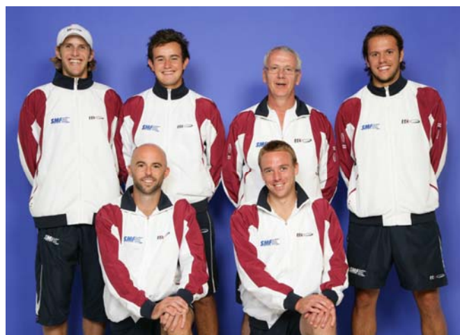
Bromley LTC Men (Runners Up 2008)